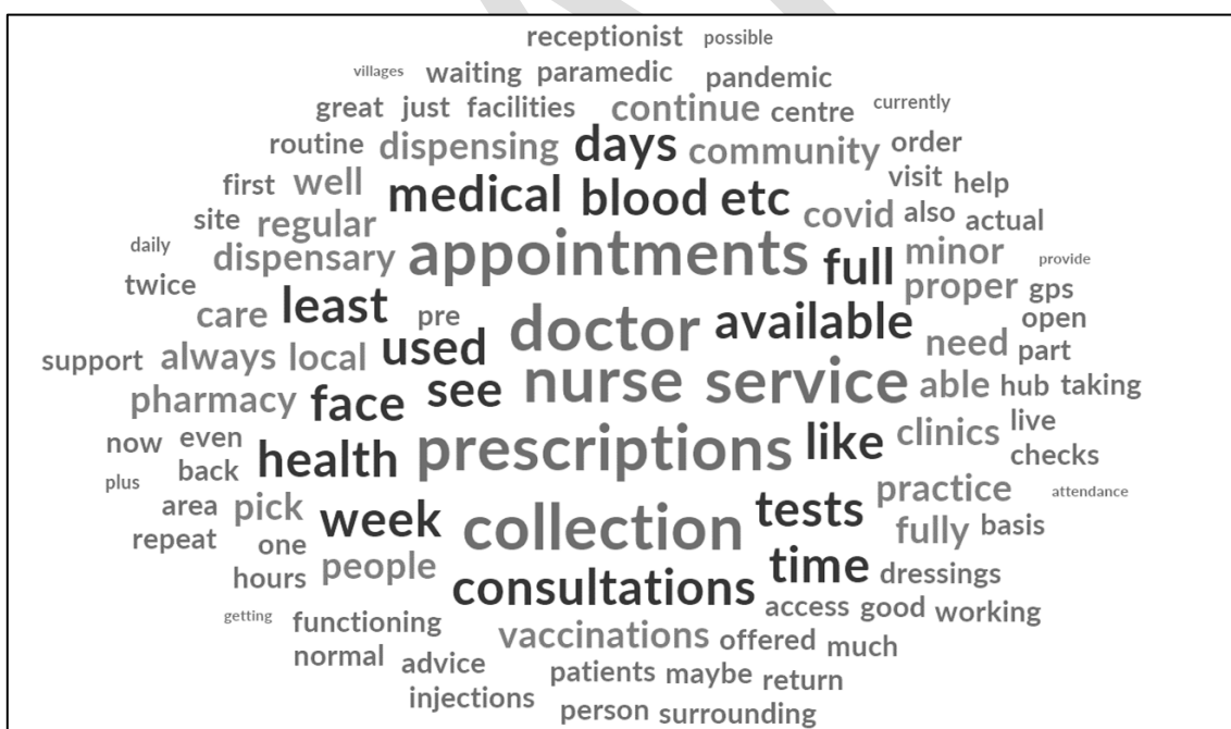
Figure 3. A word cloud displaying the most common words in the responses to the question ‘If Blakeney Surgery is able to remain open, how would you like to see it be used?’

We asked respondents how they would like to see Blakeney Surgery used in the future if it was able to stay open. In Figure 3 below is a word cloud for responses to this question, the larger the word the more often it was used by respondents. The cloud shows that the most common words were appointments, prescriptions, doctor, nurse, collection, and service.